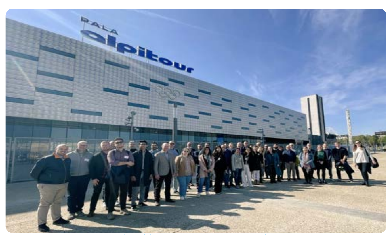
APPRAISE Pilot visit and General Assembly, Turin, October 2022.